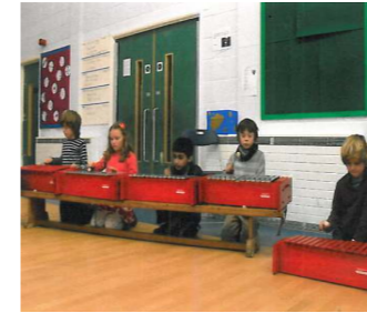
Glockenspiels in Music lessons.

In year 4 we have learnt to play the djembe. Now we are learning to play the glockenspiel. In the summer we will put them both together.